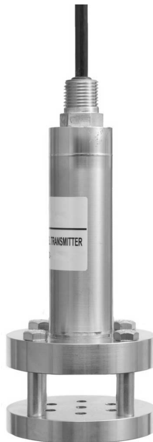
LD32 Series Pump Lift Station

QS301031 Rev C ©2013 Flowline, Inc. All Rights Reserved Made in USA