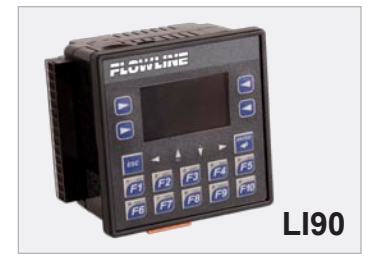
DataPoint™ Level Controller