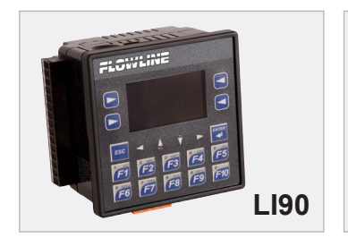
DataPoint™ Level Controller