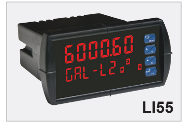
Commander™ Multi-Tank Level Controller